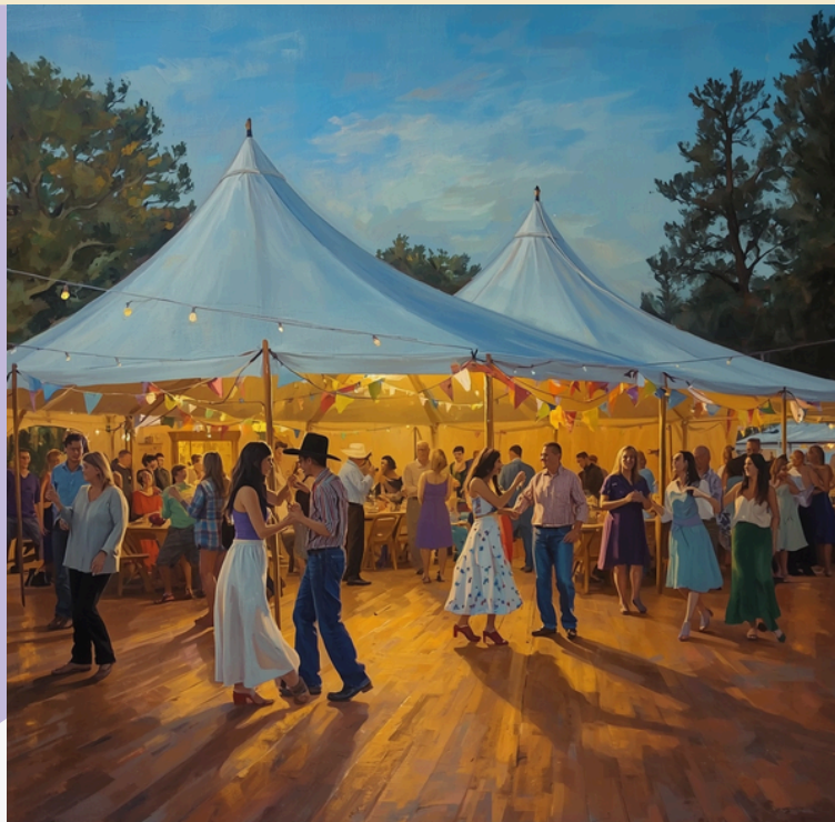
Artist concept image

The Fort McMurray Hootenanny is an unforgettable summer celebration bringing the community together for an evening of live music, great food, cold drinks, and high-energy entertainment under the open sky. Hosted in support of the arts, this western-themed fundraiser combines small-town charm with big-event excitement, creating a lively atmosphere where guests can connect, celebrate, and give back.